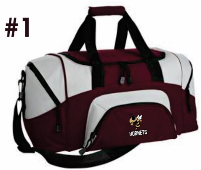
PORT AUTHORITY SMALL DUFFEL $24.00