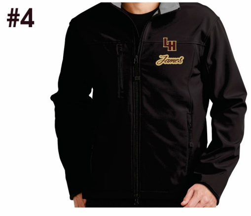
SOFT SHELL JACKET XS-4XL, WXS-W4XL $55.00