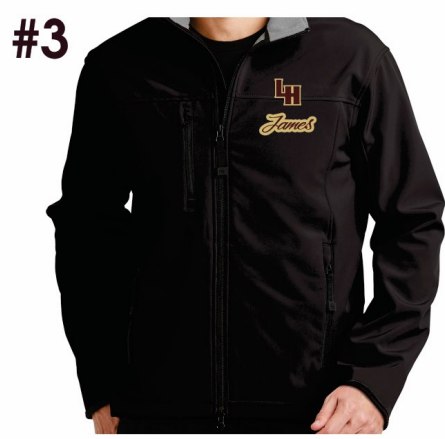
SOFT SHELL JACKET XS-4XL, WXS-W4XL $55.00

CAN PERSONALIZE WITH NAME **SPECIFY ON ORDER SHEET**