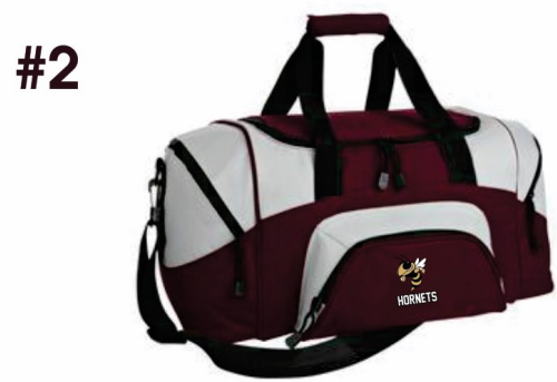
PORT AUTHORITY LARGE DUFFEL $27.00

CAN PERSONALIZE WITH NAME **SPECIFY ON ORDER SHEET**